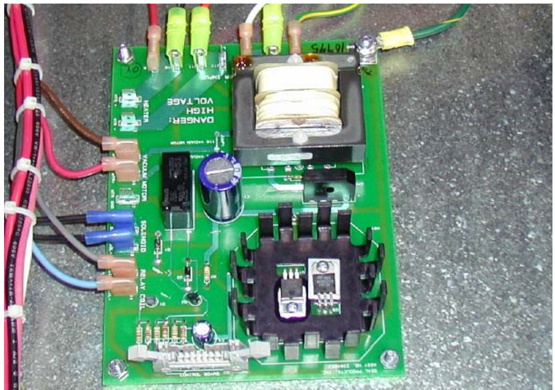
Pictured above is the power board.