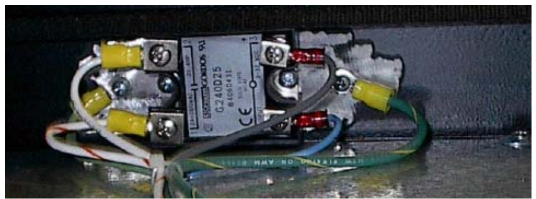
Pictured above is the solid-state relay. It is mounted beneath the diaphragm on the far right side of the access panel.