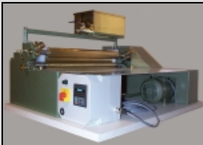
Rear View showing Inverter