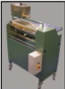
Senator with Stand