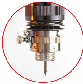
Standard 1 1/64" spindle (Various types of spindles available as options)