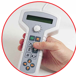
Remote control for various engraving functions

• Machine dimensions 35.4 x 24.2 x 33 in