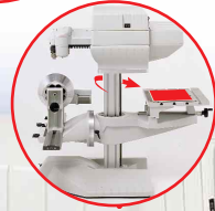
Multiple positions of central clamping system