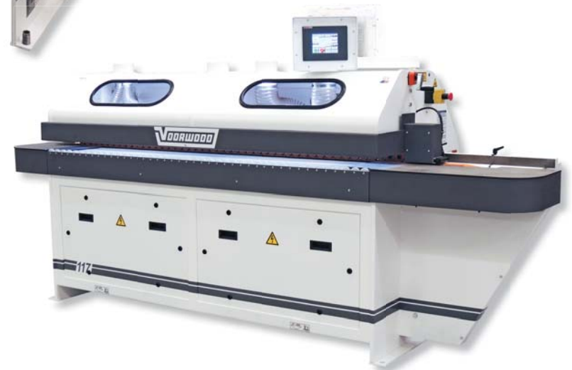
L117 with 7 station capacity