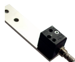
Mist spray cooling system