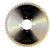
Special blades for wood or for aluminum