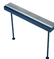
Right Extension with gauge Left Extension without gauge