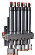
Multiple vertical clamping system